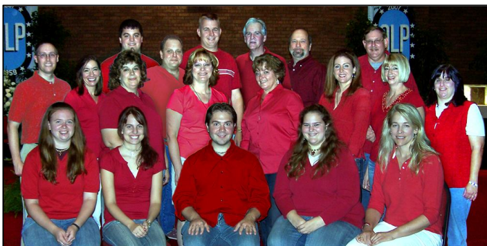
Selah Praise Band

For more information or a sponsorship office@peopleforlife.org form, call (814) 882-1333 or e-mail