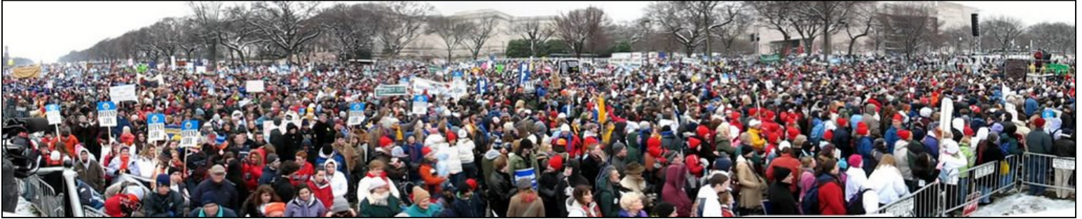
Washington, DC (January 22, 2007) – Two hundred thousand Marchers for Life converge on the National Mall

On January 22, 1973, the day of the infamous Roe v. Wade decision that removed legal protection from all unborn children in the United States, the headline of the New York Times gloated, "Supreme Court Settles Abortion Issue."