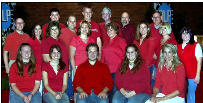
Selah Praise Band

For more information or a sponsorship form, call (814) 882-1333 or e-mail office@peopleforlife.org .