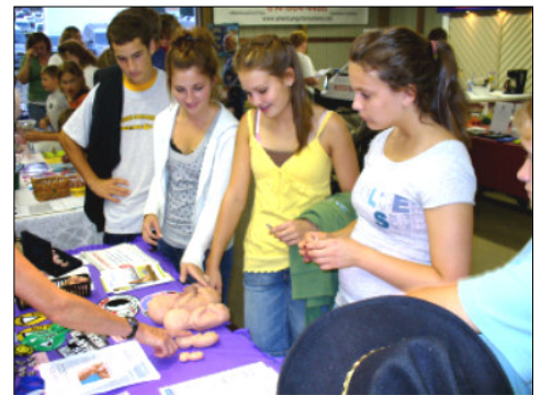
Outreach booths with a positive, pro-life message (top to bottom): Corry Fest, Praise on the Bay, Dan Rice Days, Warren County Fair, Waterford Community Fair